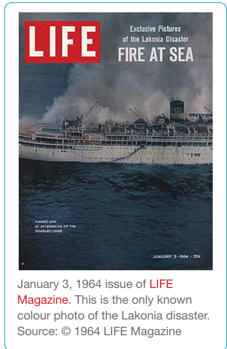
January 3, 1964 issue of LIFE Magazine . This is the only known colour photo of the Lakonia disaster.

Order to abandon the ship was given by the Purser just before 1.00 am, with dazed passengers trying to make their